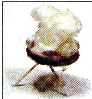
Another found art sculpture from artist Kris Cowen.

Although the pair have already established significant membership in fine art base, have already hosted workshops with established artists, have already held art exhibitions,